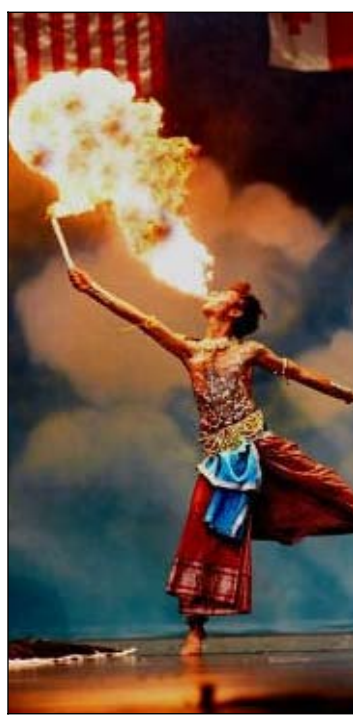
The International Children's Festival is known for a variety of acts, including (from left) acrobats from the Ludvika Minicircus, "firebreathers" from India and dancers from the Conservatorio Profesional de Danza in Madrid, Spain.