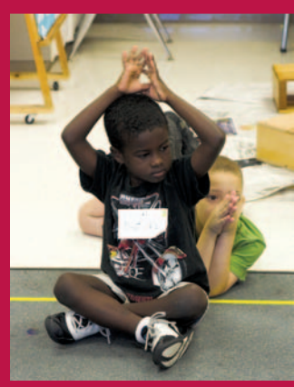
The performing arts become an integral part of educating young children through Wolf Trap's proven teaching methods.

The Institute residency model has proven successful in classrooms across the country for more than 25 years.